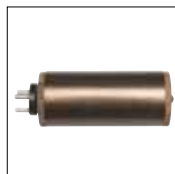
Item No. 3065 Heating element 3000 W, 230 V