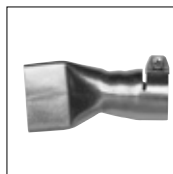
Item No. 4003 Nozzle, 40 mm flat