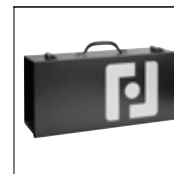
Item No. 7012 Metal case