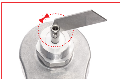
Rotation by 360° with reversal of direction of rotation