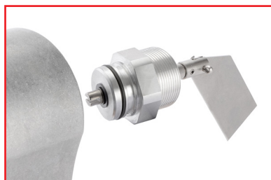
Device head can swivel and be pulled off