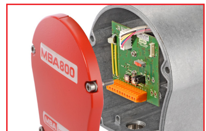
Selectable parameter sets