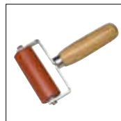
Item No. 7002 Pressure roller two- armed, 80 mm