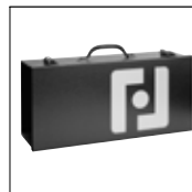
Item No. 7012 Metal case