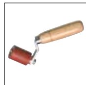
Item No. 7006 Pressure roller one- armed, 45 mm, 45° offset (patented)