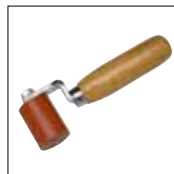
Item No. 7001 Pressure roller one- armed, 45 mm