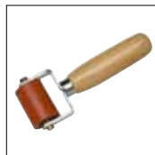
Item No. 7000 Pressure roller two- armed, 45 mm