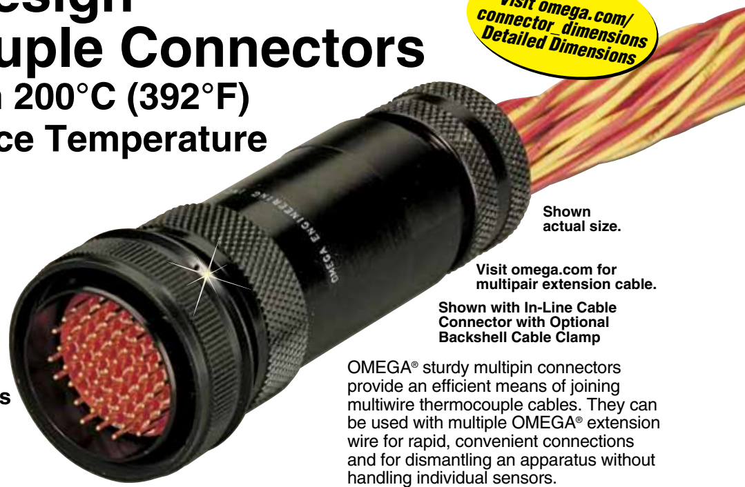
Shown actual size.

Visit omega.com/connector_dimensions Detailed Dimensions