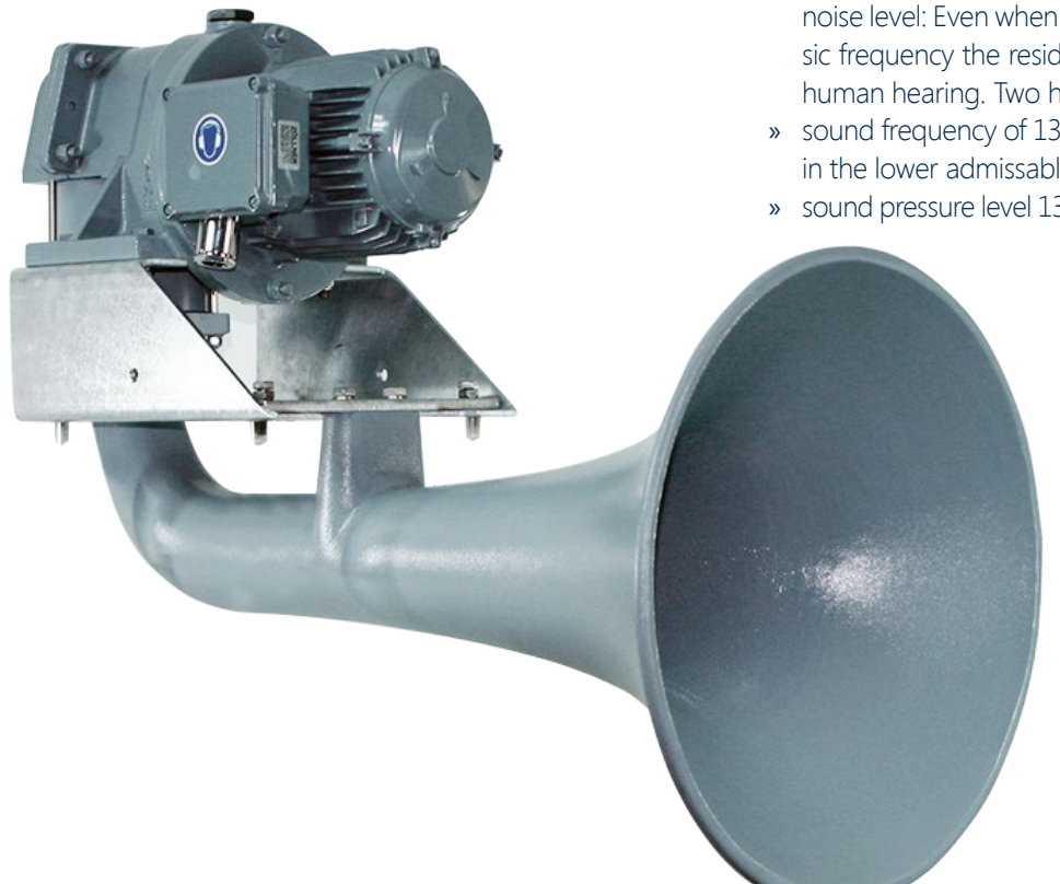
Safety for today and tomorrow. Worldwide.