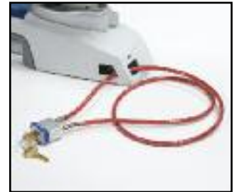
Security Device accessory (Lock & cable sold separately)