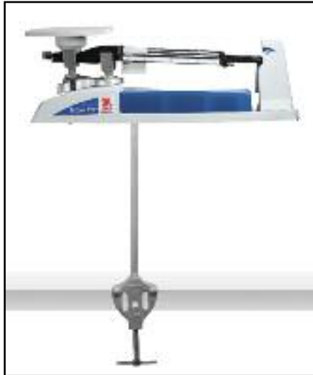
Included Rod & Clamp accessory for specific gravity experiments