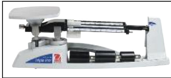
Three masses included with balance