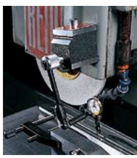
Top: 657A with 196B1 Universal Dial Indicator setting up workpiece on milling machine Above: 657A with 711LS Last Word Dial Test Indicator setting up workpiece on surface grinder