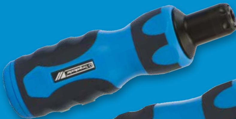
Pro 25 & 150

For Bits & Blades... see pages 64-66 or visit www.torqueleader.com