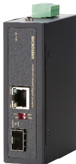
Fig. 1: Entry Line Gigabit Ethernet SFP Bridging Converter

All new devices distinguish themselves with easy handling (Plug&Play) and do not need extensive configuration. New developments are focusing on increasing the port numbers and further implementation of Gigabit Ethernet.